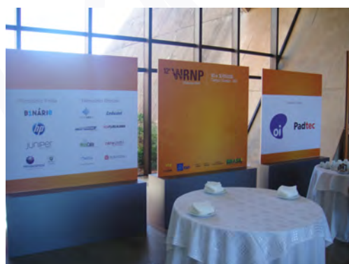
Panels at the WRNP 2011 coffee-break area