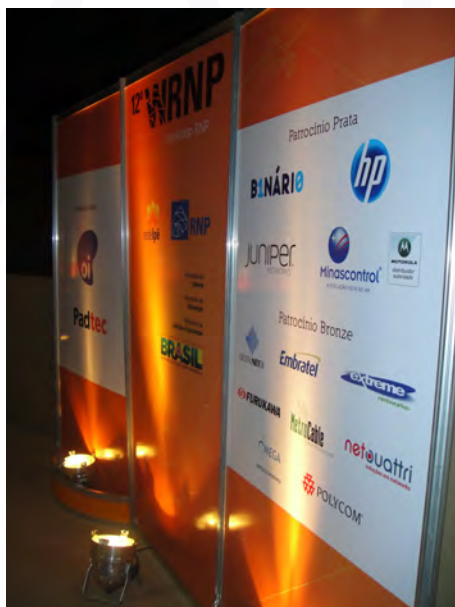
Panels at the WRNP 2011 auditorium

RNP provides to companies the possibility of sponsoring the 13th RNP's Workshop and of associating to its brand the qualities present in the event (innovation, technology, commitment with teaching and research in Brazil). The counterparts to the supports are varied and aim at publicizing the brand, the sponsor's products and solutions in printed material and several media. The sponsorship modalities (see table on the back of this leaflet) provide varied investments, which may be made as financial resources or services for the holding of the event. The number of sponsors is limited.