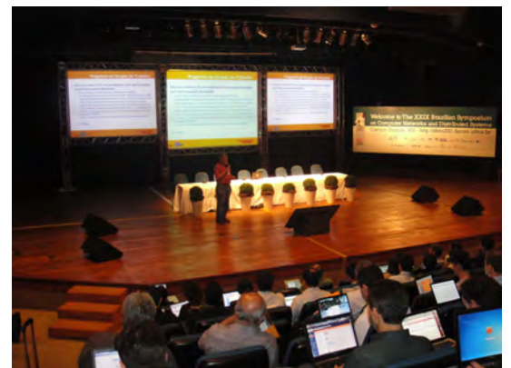
WRNP 2011 auditorium